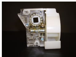
New plastic housing cord tilter 4mm opening, part #50115004.

In order to meet these challenges head-on, Ventana has developed new components that will help in minimizing the cost increases such as: